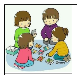
Play a game (snap, bingo, board game). Whose turn is it?